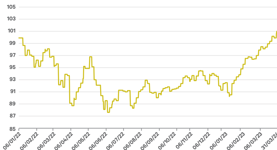
Figure 1: Performance of Davy SRI Moderate Growth Fund at 31 st March 2024