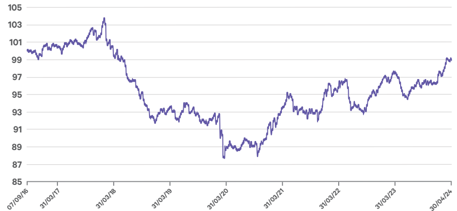
Figure 1: Performance of Target Return Foundation Fund at 30 th April 2024