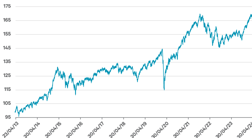
Figure 1: Performance of Davy Moderate Growth Fund at 30 th April 2024 6

Warning: Past Performance is not a reliable guide to future performance. The value of your investment may go down as well as up. This product may be affected by changes in currency exchange rates.