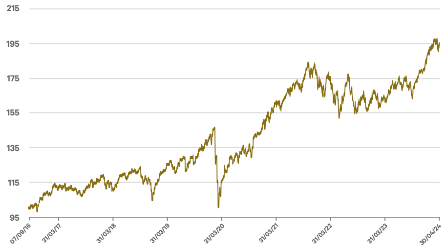
Figure 1: Performance of the Global Equities Foundation Fund at 30 th April 2024

Warning: Past Performance is not a reliable guide to future performance. The value of your investment may go down as well as up. This product may be affected by changes in currency exchange rates.